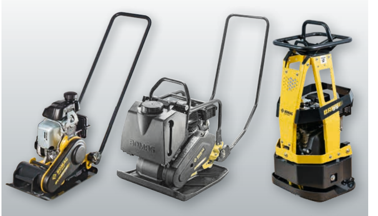
Applications: Soil and asphalt compaction, Interlocking blocks, repair and maintenance, patching, sports fields and landscaping.