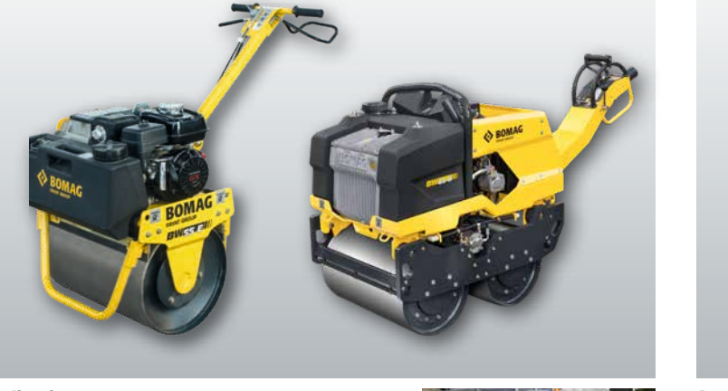
Applications: Soil and asphalt compaction. Construction and maintenance of pavements, shoulders, walking and cycle tracks, access and parking areas, sports and playgrounds, forestry and estate roads.