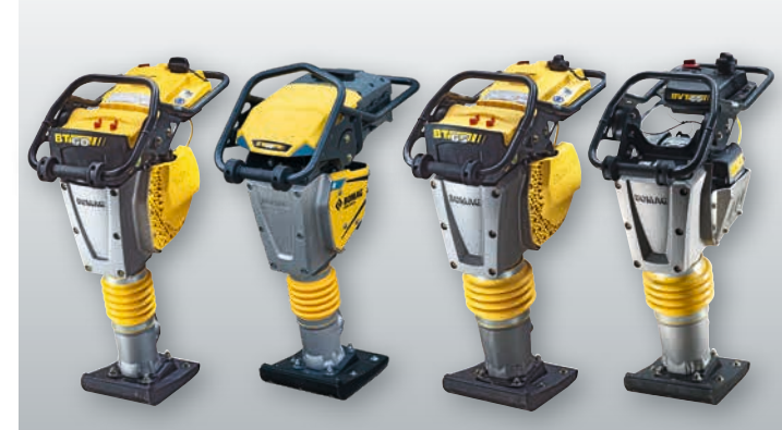
Soil and asphalt compaction. Trenches and pipeline projects, backfill, foundations, patching and asphalt repair.