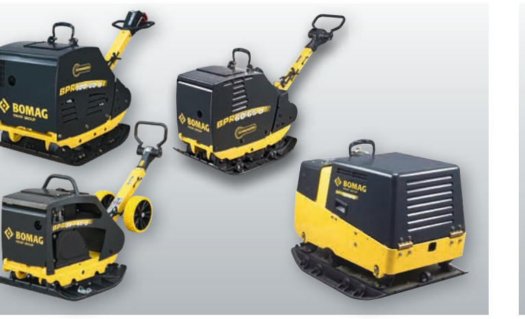
Soil and asphalt compaction, paving. Highway and footpath construction and maintenance, backfill, trenches and pipelines, sportsgrounds and landscaping, interlocking blocks and groundworks.