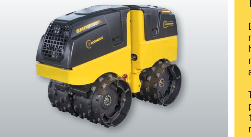
Applications: Soil compaction. Trenches and pipelines, backfill and foundations – wherever high mobility, manoeuvrability and simple handling are required on difficult soils.